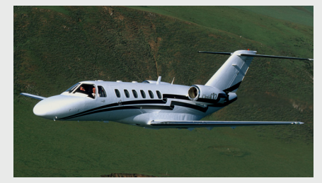
CITATION CJ2, CJ2+